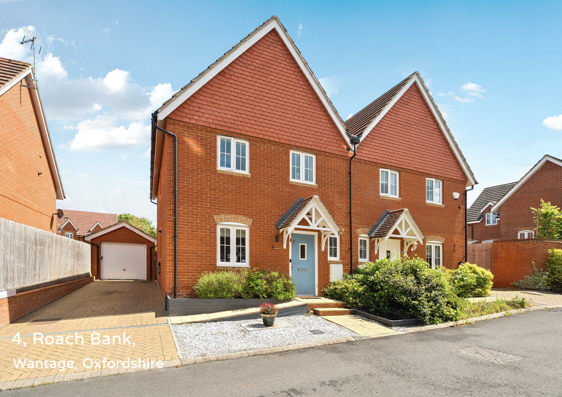
4, Roach Bank, Wantage, Oxfordshire